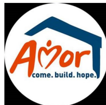
Men's Mexico Build

Not to be outdone by the ladies, 16 of our men headed to Mexico in May for a "Men's Mexico Build". In partnership with the men of Gig Harbor, Washington and Amor ministries they built a house from the ground up in five days, and built many new relationships in the process.